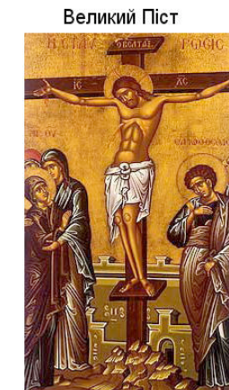
The Great Fast

НЕДІЛЯ 3-тя ВЕЛИКОГО ПОСТУ - ХРЕСТОПОКЛІННА. Голос 6